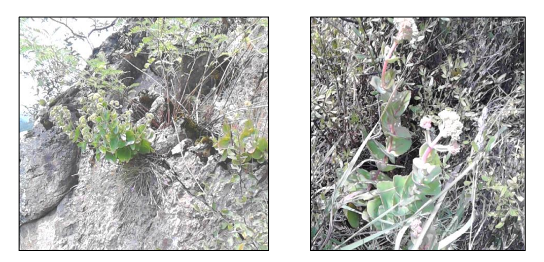
Figure 1. S. caucasicum plants at anthesis under natural conditions.